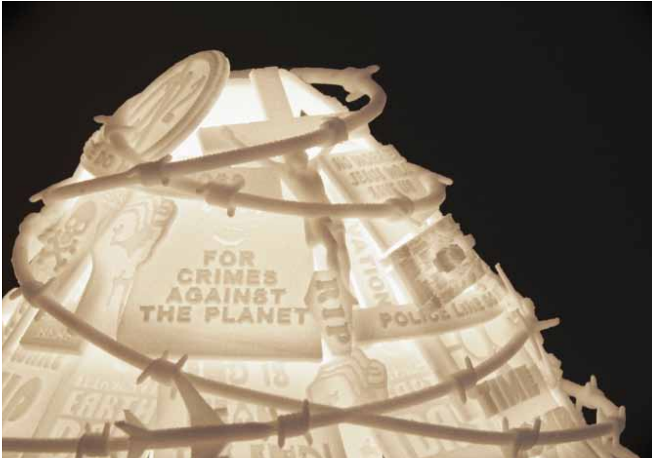
From top to bottom: "Riot" lamp in action "Dahlia" lamp