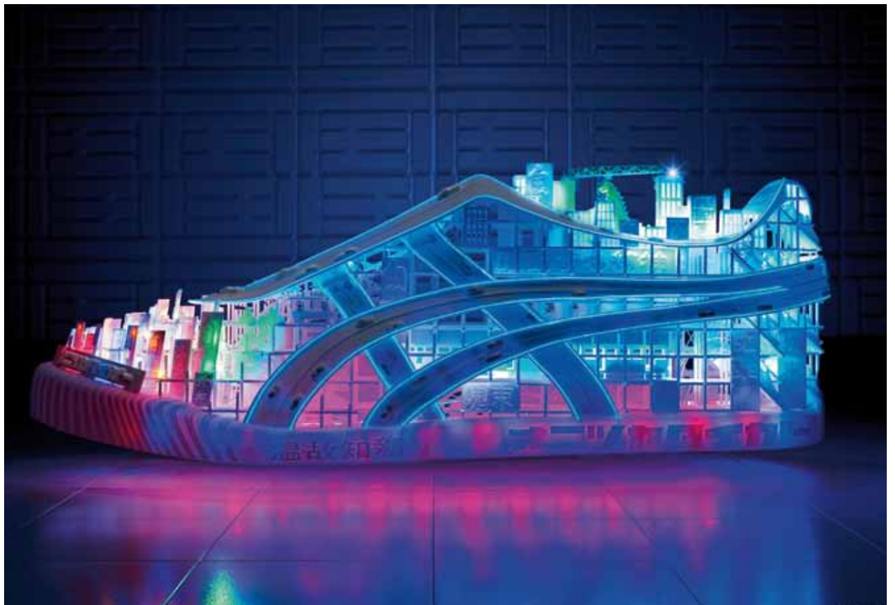
Sculpture Design for an Onitsuka Tiger Campaign