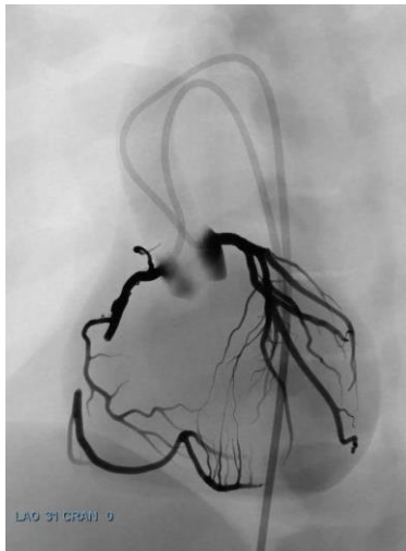
Advanced Coronary intervention scenario of chronic total occlusion (CTO) using the ANGIO Mentor simulator

ROCK HILL, South Carolina, October 12, 2015 – 3D Systems (NYSE:DDD) announced today the introduction of advanced cardiology training modules for the ANGIO Mentor™ VR simulator, together with a cardiovascular anatomical model product line that allows visualization of complex cardiovascular anatomy.