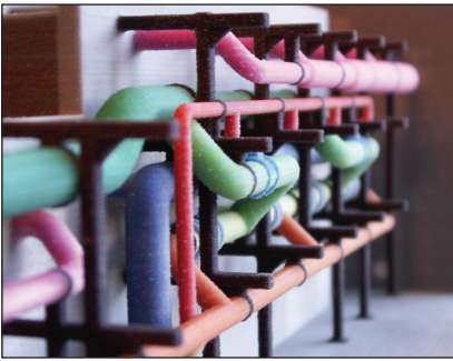
Model of a water plant renovation project in Kaliningrad, Russia