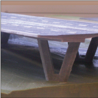
Model of a motorway overpass near Vejle, Denmark

“Architectural designers think in spatial terms, and a 3D model helps bridge the gap between them and the engineers charged with bringing the design to reality. With a physical model, the engineers can see the concept in concrete terms and can easily imagine themselves in the 3D space.”