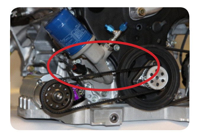
Oil Filter Housing

In the final analysis, HPD's HR28TT engine project was a complete success; their engines are reliable and meet the racing community's expectations and requirements. HPD's use of the ProJet CPX 3000 allowed them to reduce up to two weeks of design time by eliminating the need to incorporate draft and remove any undercuts on the components - an absolute requirement for traditional methods. Manufacturing time was reduced because there was no need to create injection wax tools to produce the master patterns for the local foundry. And lastly, they could make design changes and start testing in an average of four week versus eight weeks when using other manufacturing methods. This improvement alone allowed almost twice as many improvements to be incorporated into the design. HPD is now using the ProJet CPX 3000 RealWax parts for all of their new engine projects.