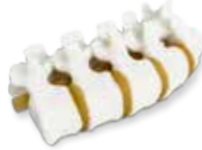
Print realistic medical models in rigid and elastomeric materials