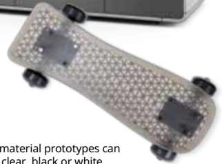
Multi-material prototypes can blend clear, black or white to communicate ideas and simulate finished products