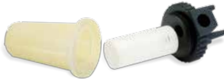
Functional filter prototype printed in clear, white and black rigid plastics

Part accuracy and material performances perfectly suit rapid tooling applications