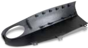
New rigid black plastic Visijet® CR-BK enables even more composite mechanical performances