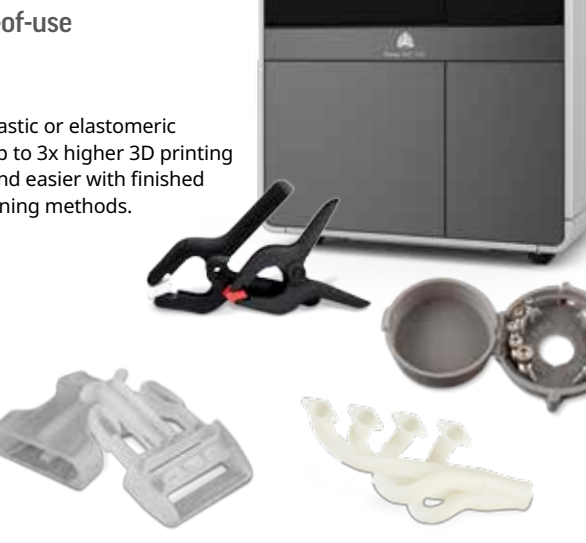
Combine pliability and strength to test elastomeric part designs in VisiJet® M2 EBK (black) or ENT (natural).

Accessing high fidelity, functional plastic or elastomeric prototypes has never been faster, up to 3x higher 3D printing speeds than similar class printers, and easier with finished parts up to 4x faster than other cleaning methods.