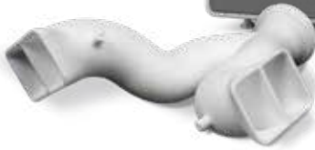
Manifold printed in DuraForm ProX FR1200