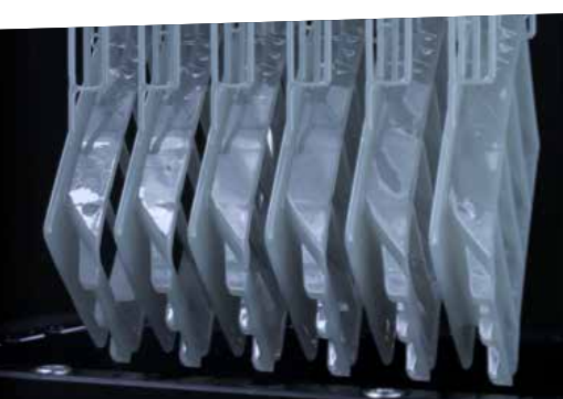
Figure 4<sup>™</sup> delivers ultra-fast additive manufacturing technology in discrete cells, allowing it to be placed into automated assembly lines and integrated with secondary processes, including washing, drying and curing.