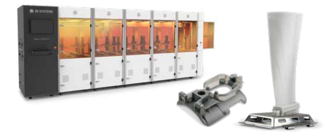
Figure 4 Production packages the design flexibility of additive manufacturing in configurable, in-line production modules to deliver a customizable and automated direct 3D production solution. Features like automated material delivery and integrated post-processing reduce hands-on processes to streamline operations and lower total ownership costs.