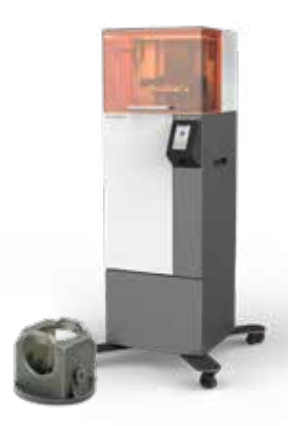
Figure 4 Standalone is an affordable and versatile solution for low volume production, and fast prototyping in the tens and hundreds of parts per month. Figure 4 Standalone offers quality and accuracy with industrial-grade durability, service and support.

Affordable industrial-grade solution for lower cost production parts