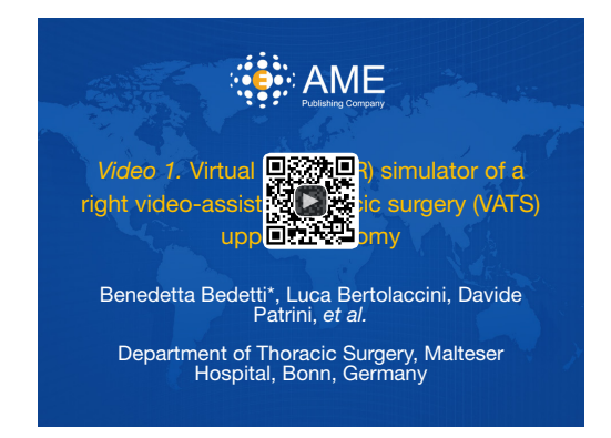
Figure 1 Virtual reality (VR) simulator of a right video-assisted thoracic surgery (VATS) upper lobectomy (11). Available online: http://www.asvide.com/article/view/26669

The adoption of this technique has proven to give better results, providing a faster postoperative recovery, less pain and fewer complications (3,4). Therefore, the number of patients operated by VATS is rapidly increasing, along with the need for proper training for surgeons in this technique. The effectiveness of training VATS resident surgeons using virtual reality (VR) simulators is stated in many studies, however its use is still not established in the normal practice (5). Useful VR simulators can integrate 3-dimensional (3D) imaging, have customizable instrumentation and should expose trainees to many anatomic variations to reduce the need for continuous oneon-one instructor observation (6,7). The purpose of this study is to create a VR curriculum to offer an evidencebased approach for VATS training programs.