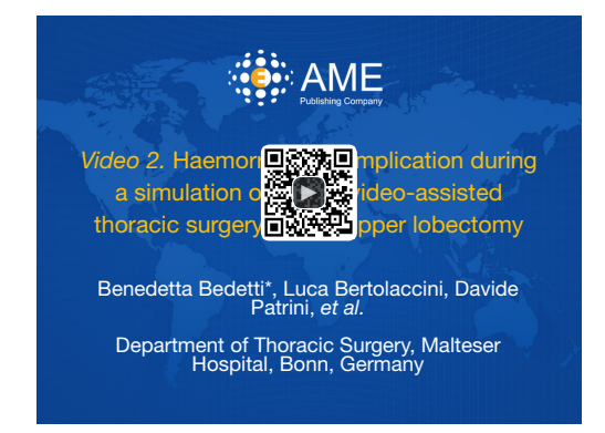
Figure 2 Haemorrhagic complication during a simulation of a right video-assisted thoracic surgery (VATS) upper lobectomy (12). Available online: http://www.asvide.com/article/view/26670

Twenty voluntaries completed all tasks (trainees =12,