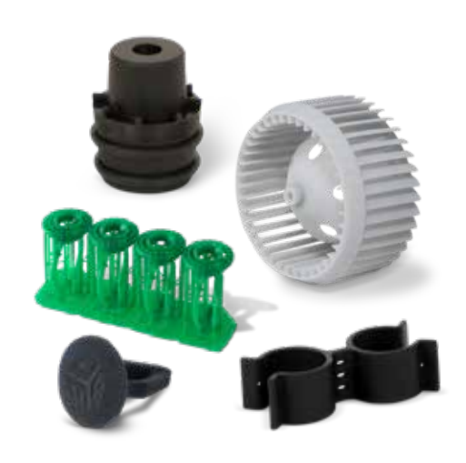
From tough and flexible engineering plastics to elastomeric or castable materials, the FabPro ^{\rm TM} materials are designed for accuracy and quality.

From initial concept models to engineering, validation, and finally production, the industrial-grade FabPro 1000 desktop 3D printer enables rapid manufacturing of parts to meet your product design and development needs. Ideal for engineering and jewelry applications, the FabPro 1000 excels at low-volume, small-part prototyping and direct 3D production across a range of materials, producing high-quality parts with lightning speed, remarkably low operating costs and unsurpassed ease of use.