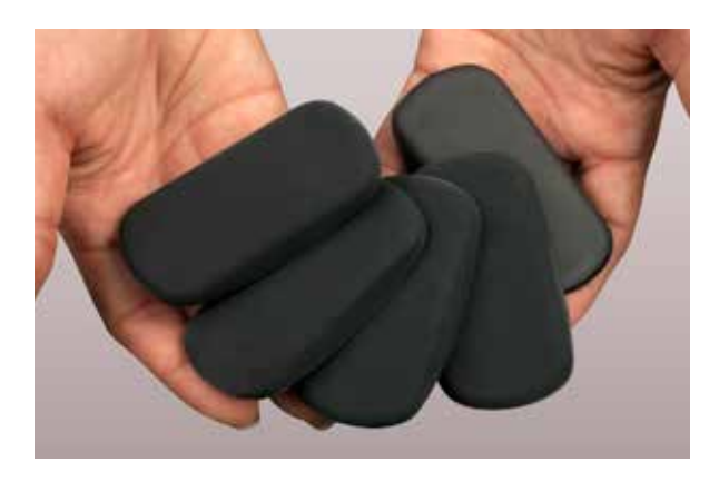
Preparing part files for printing, design validation and mass production is easy with 3D Sprint® software and the FabPro 1000.