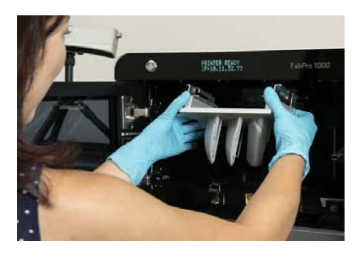
This desktop powerhouse packs industrial durability and reliability into a rugged yet compact platform.

FabPro 1000 will help shepherd the manufacturing process as ideas are validated and brought to production. FabPro 1000 assists engineers in creating accurate, functional prototypes that look and perform like final products. This makes it easier to verify the design, fit, function, and manufacturability before investing in expensive tooling and moving into production, when the time and cost to make change becomes burdensome. FabPro 1000 will quickly deliver functional prototypes for real-life testing to assess how a part will function when subjected to its expected usage.