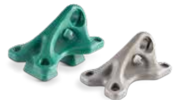
Deliver better performing, more cost-effective components with topology optimization and part consolidation.