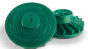
Customized components or short run production without the cost and delay of tooling

Streamline your file-to-pattern workflow with the advanced 3D Sprint® software capabilities for preparing and managing the additive manufacturing process, unattended high speed printing and a defined and controlled post-process methodology. Multijet Printing ease-of-use and dependable process ensures reliable performance, yield and results.